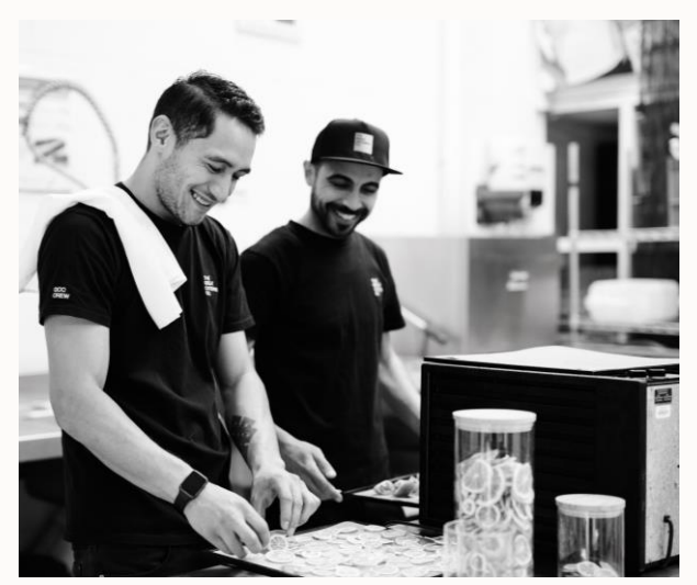
THE GREAT CATERING CO.